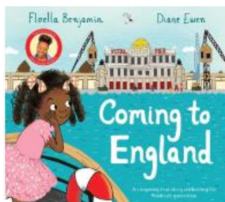
Coming to England by Floella Benjamin

The texts we will be looking at in detail in the first half of the Summer Term are: