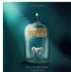
Barnabus Project by the Fan Brothers