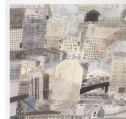
Illustration from 'The Promise'

Art- Linked to the topic of environmental change and sustainability, our Artist for this term is Henri Rousseau. Pupils will learn a little about the artist and explore different examples of his work in order to identify features typical of his art. In particular, pupils will explore how to use texture and colour to create a mood that contrasts his- the result of human activity on the Earth. Pupils will first create a collage and then build on this by designing and creating an applique scene that links to an illustration from 'The Promise' text studied in English.