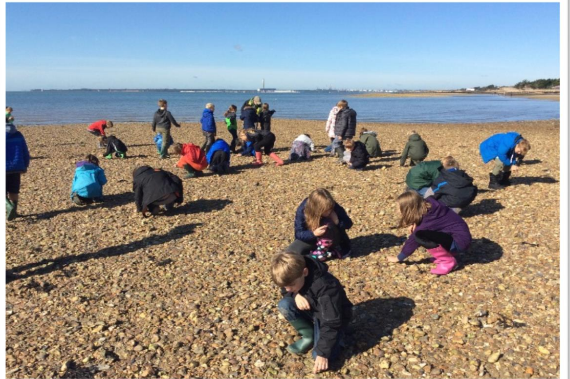
Stubbington Study Centre residential week