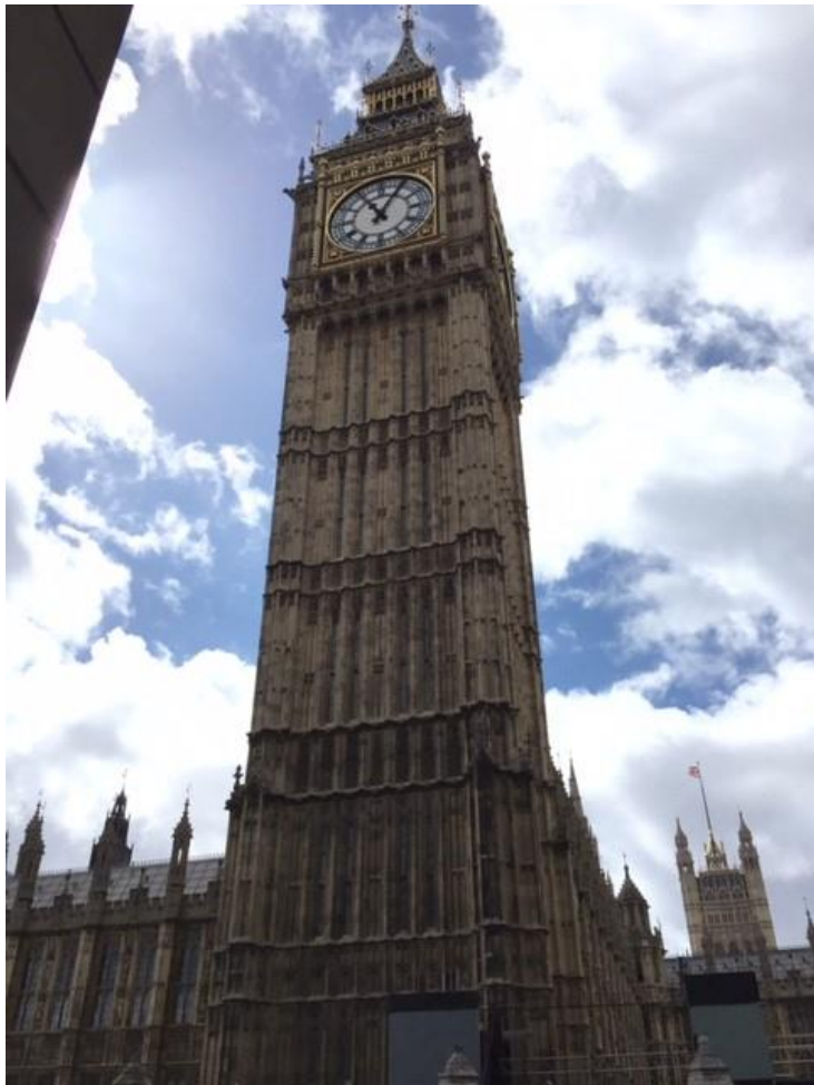
Houses of Parliament